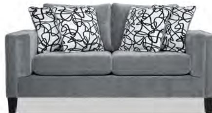
Lola model 67" Loveseat: Color Choices