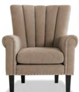
Scarlett: Color Choices