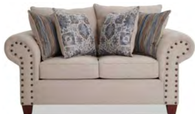
Kara model 51" Loveseat (Beige)