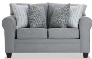
Laurel model 65" Loveseat: Color Choices

Loveseat: (select one style and color) Please be sure the loveseat will fit the room if you are in a studio!