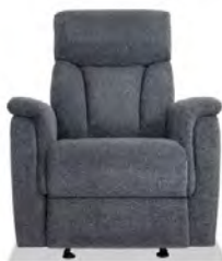
Brady Glider Recliner: Color Choices