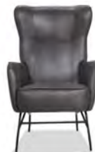
Cleo: Color Choices