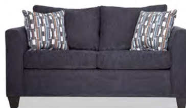
Stevie model 65" Loveseat: Color Choices