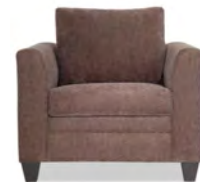
Stevie: Color Choices