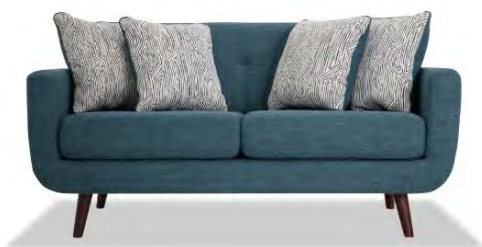
Bettie model 65" Loveseat: Color Choices