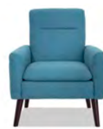
Flynn: Color Choices