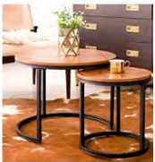
Studio Nesting Tables

Coffee tables: (Select one style, Please consider apartment size)