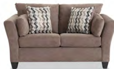
Virgo model 69" Loveseat: Color Choices