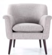
Reece: Color Choices